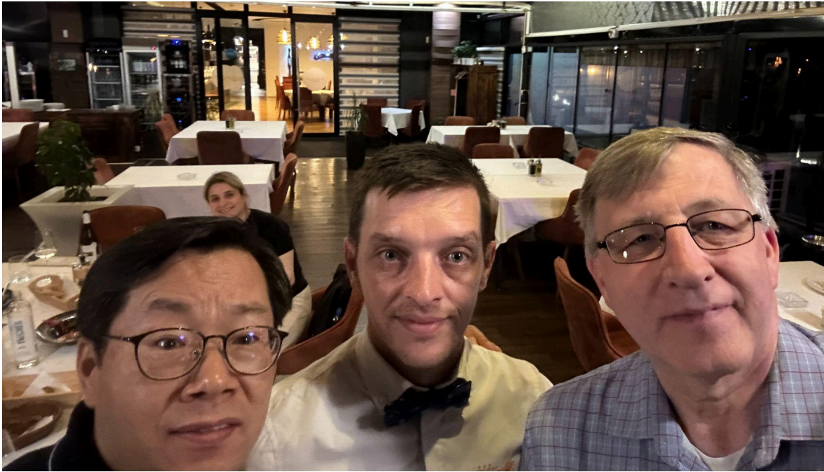
God sent a Macedonian man who wants to study the Bible