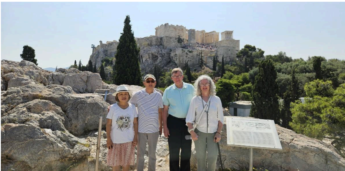
At the Areopagus, where Paul preached in Acts 17; Parthenon in the background