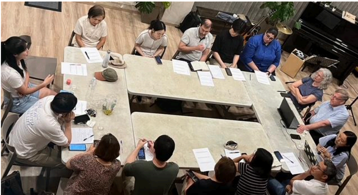
English Group Bible Study in Athens with Greek coworkers