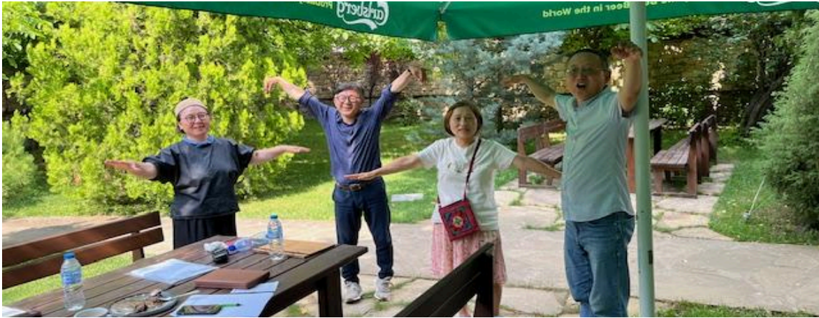
Victorious servants of Christ, like eagles soaring on their wings