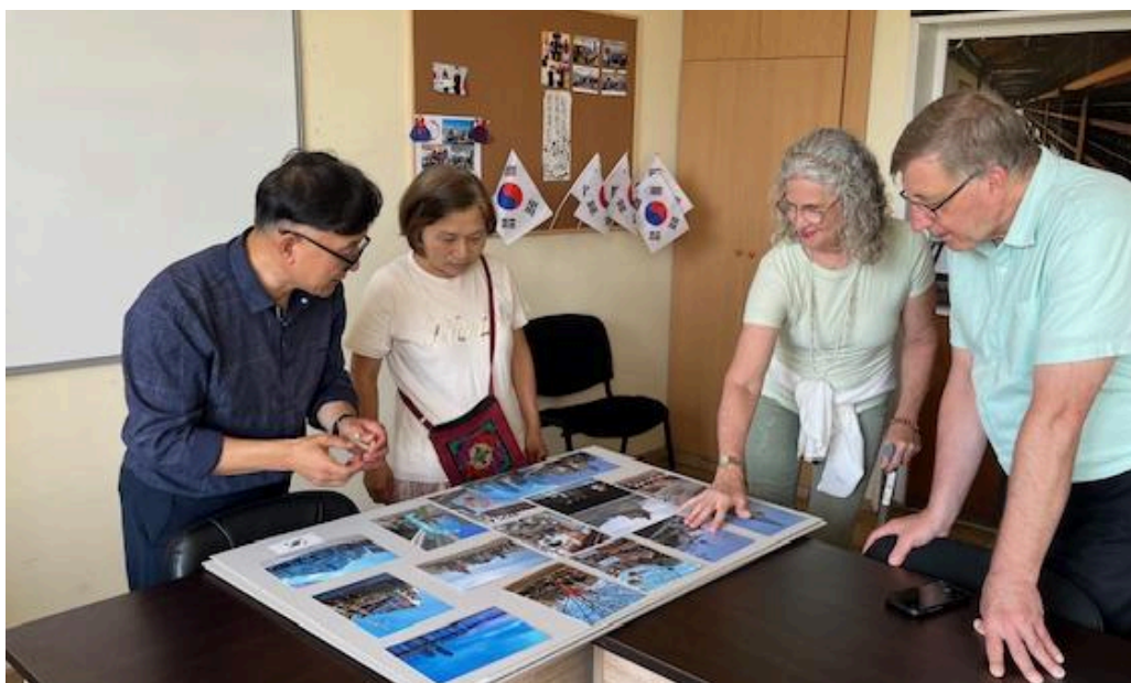
A time of fellowship in the classroom, “Jesus’ church”