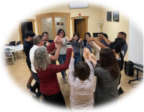
Hungarian dance performance