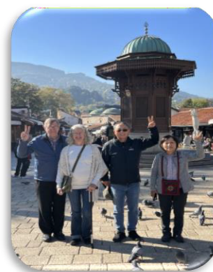
Proclaiming Jesus' victory In downtown Sarajevo

After leaving Serbia, we crossed through Bosnia-Herzegovina. It is a nation of about four million people of mixed ethnicities and religions: 51% Muslim, 31% Serbian Orthodox, and 15% Catholic. Upon entering each village, we soon noted either a mosque with a crescent on top, or a church with a cross on top. Accordingly, the entire village would be identified as Muslim or Christian. My most impressive memory of this nation was formed in the city of Sarajevo. It is a beautiful city, sometimes called the Jerusalem of the Balkans. Within a single neighborhood there is a mosque, an Eastern Orthodox church, a Catholic church and a Jewish synagogue.