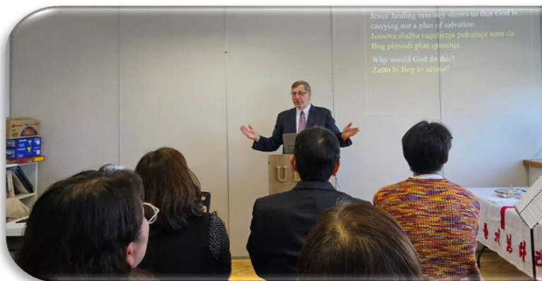
Sunday message in Zagreb