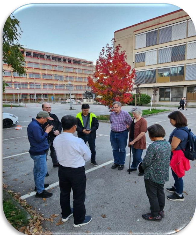
Prayer at Zagreb University, which has 70,000 students