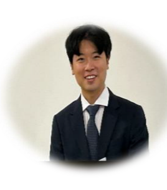
Samuel’s gracious message